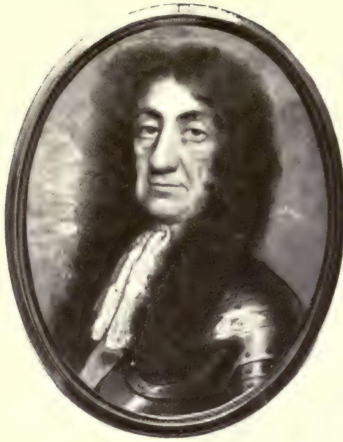
CHARLES II BY SAMUEL COOPER